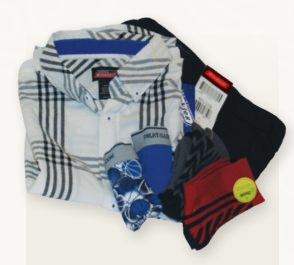
Pack A Boys (ages 11-16) 1 pair of pants

1 shirt with collar 2 briefs 2 pairs of socks