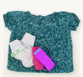
Pack D2 Girls (ages 4-6)